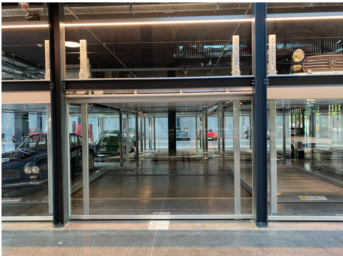
Exhibiting instead of parking: The show garage in the Classic Car House.