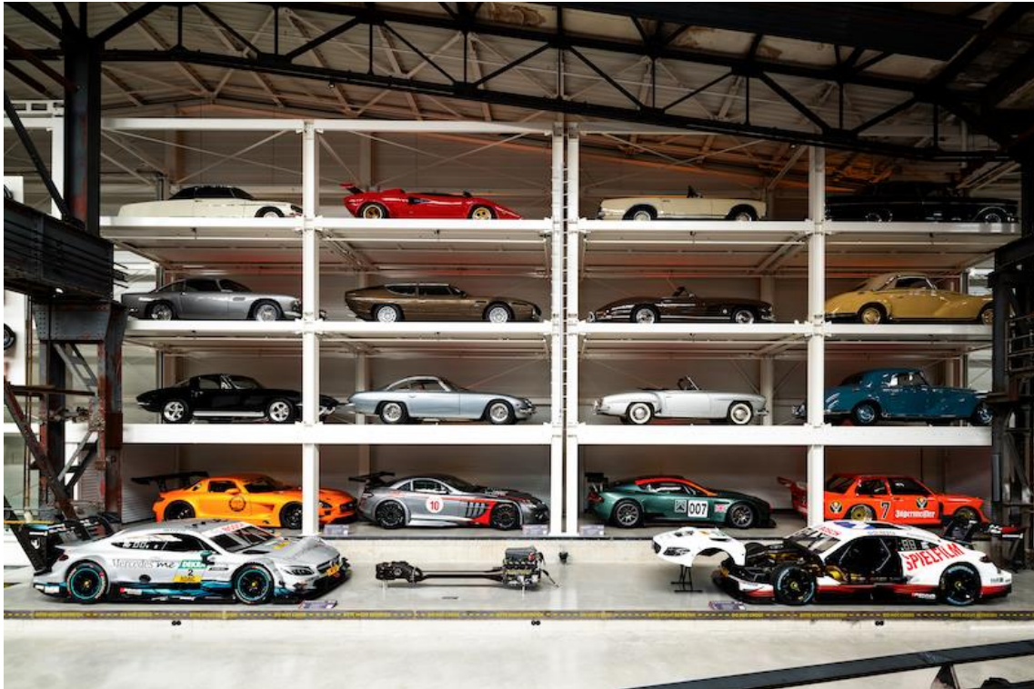
Not only practical, but also a real eye-catcher: the two WÖHR Slimparker 557 impressively present 22 of the 150 or so collector's items on the interior façade.