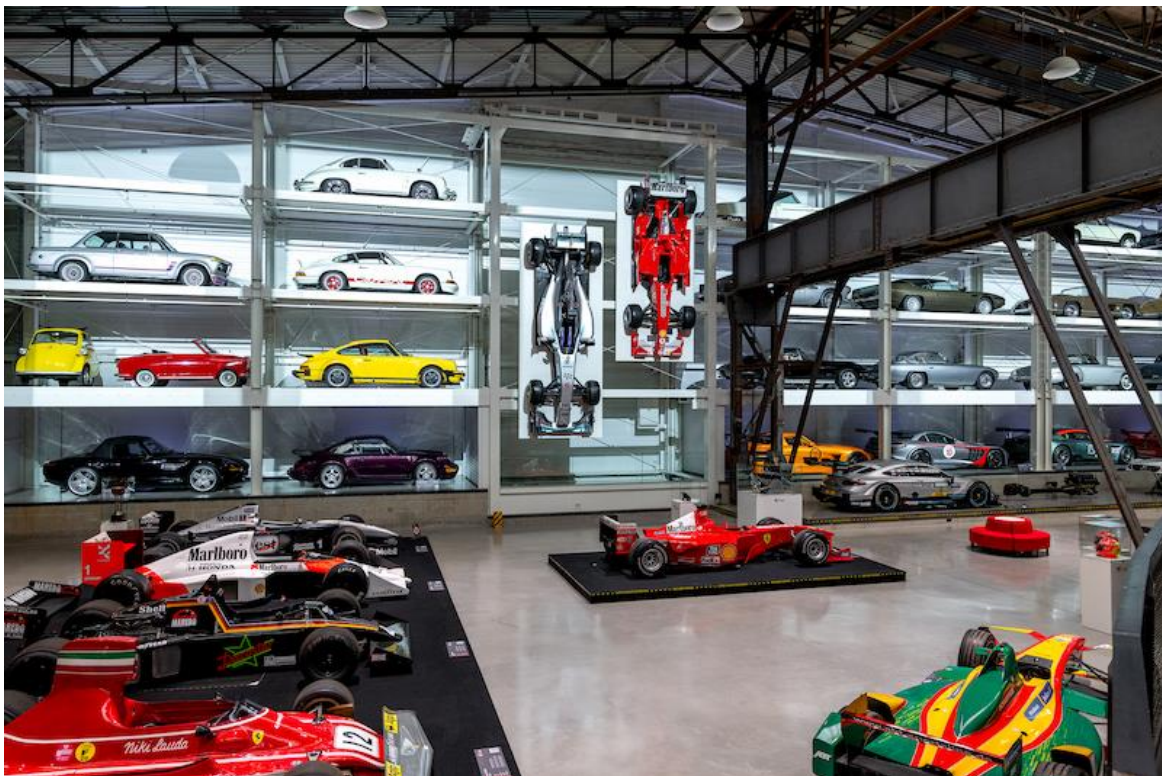
From NASCAR to Formula 1: The Loh Collection National Car Museum also has plenty to offer racing fans.