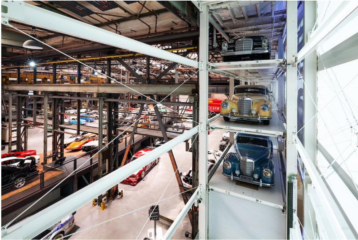
Simple, safe, space-saving: the WÖHR Slimparker 557 accommodates vehicles up to 5.30 metres in length on three levels.